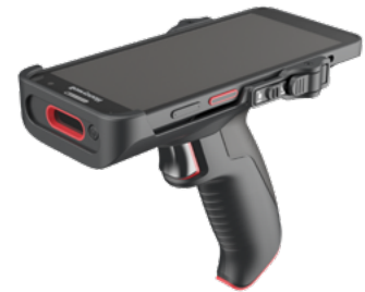
CT37 with Scan handle

The CT37 arrives with a complete set of accessories, including Universal Dock charger which can be field upgraded by the end user without tools to support multiple Honeywell field mobility computers now and in the future. Other accessories include standard and extended battery, scan handle, RFID reader handle for fast cycle counting and ruggedizing boot.