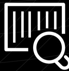
GREATER INVENTORY VISIBILITY

Integrate Transaction, and every task is simpler to perform for your workforce.