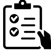
WORK ORDER MANAGEMENT