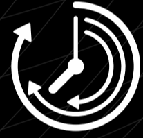
BETTER CONTROL OF LABOR HOURS