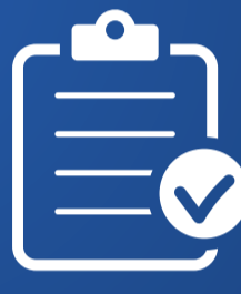
IMPROVED INVENTORY MANAGEMENT