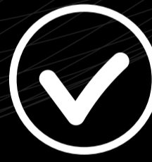
ELIMINATE DATA ENTRY ERRORS