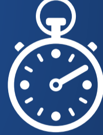
FASTER RESPONSE TIMES