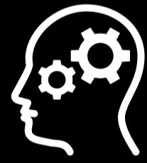
INCREASE WORKER PRODUCTIVITY

HANDHELD MOBILE COMPUTERS - RUGGED TABLETS - VEHICLE-MOUNT COMPUTERS - INDUSTRIAL BARCODE SCANNERS